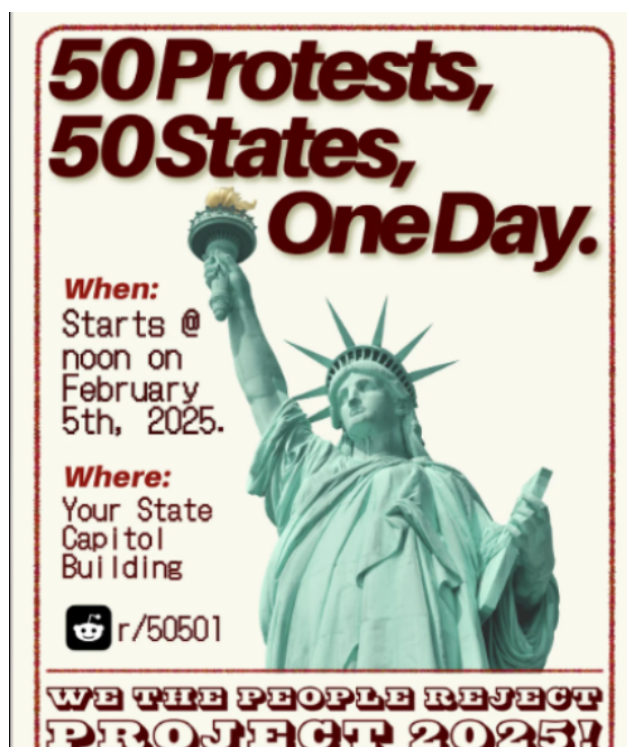
Image 1: An example of the graphics being shared on social media platforms to promote the protests on February 5th, 2025.

Turnout for the protests remains uncertain and will vary by state. The decentralized structure means participation will largely depend on local mobilization efforts. Many states will likely have low participation, but interest continues to grow online. The protests will likely feature groups marching and chanting near state capitol buildings with anti-Trump signs. Organizers have emphasized that all protests are intended to be peaceful and nonviolent. They have outlined guidelines prohibiting violence, unlawful activities, and the bringing of hazardous materials to the events.